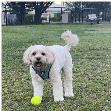
Local pooch Rosie is looking forward to meeting new friends at the dog park!

Dog owners using the new off-leash area are also reminded that just because your dog is unrestrained it's behaviour towards other dogs and people remains your responsibility.